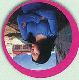
The Drug and Alcohol Information Center is a program of Compass Mark, a leader in drug and alcohol education and prevention in Lancaster County for over 40 years.