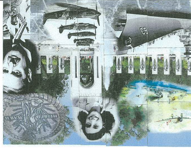
World War II puzzle picture

A Piece of the Puzzle is classroom tested and has shown to foster excitement in the learning process. A Piece of the Puzzle is an innovative game to promote the learning of historical facts and terms in a fun and meaningful process. Two different magnetic puzzles are presented in an attractive sturdy tin. Question cards are enclosed, which ask questions about a particular period of history which the puzzle depicts. One student acts as monitor and reads the questions on the cards. Students alternate with questions. If the student answers correctly, they receive a piece of their puzzle. One piece of the puzzle for each correct answer. Questions are given to students until all pieces of the puzzle are distributed and puzzles are assembled. The first to complete their puzzle now becomes the monitor and the game begins again.